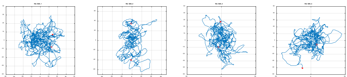
Fig. 1. Name of the figure